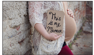
page 3 Annual Banquet

10420 Heart of Hope Way Keithville, LA 71047 318.925.4663 www.heartofhopeministry.org