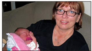
page 2 Letter From Jodi